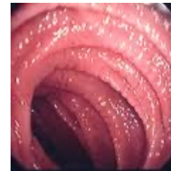
Gluten intolerance = Cøliaki